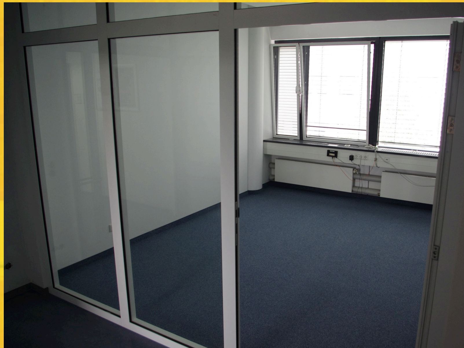
Small meeting room