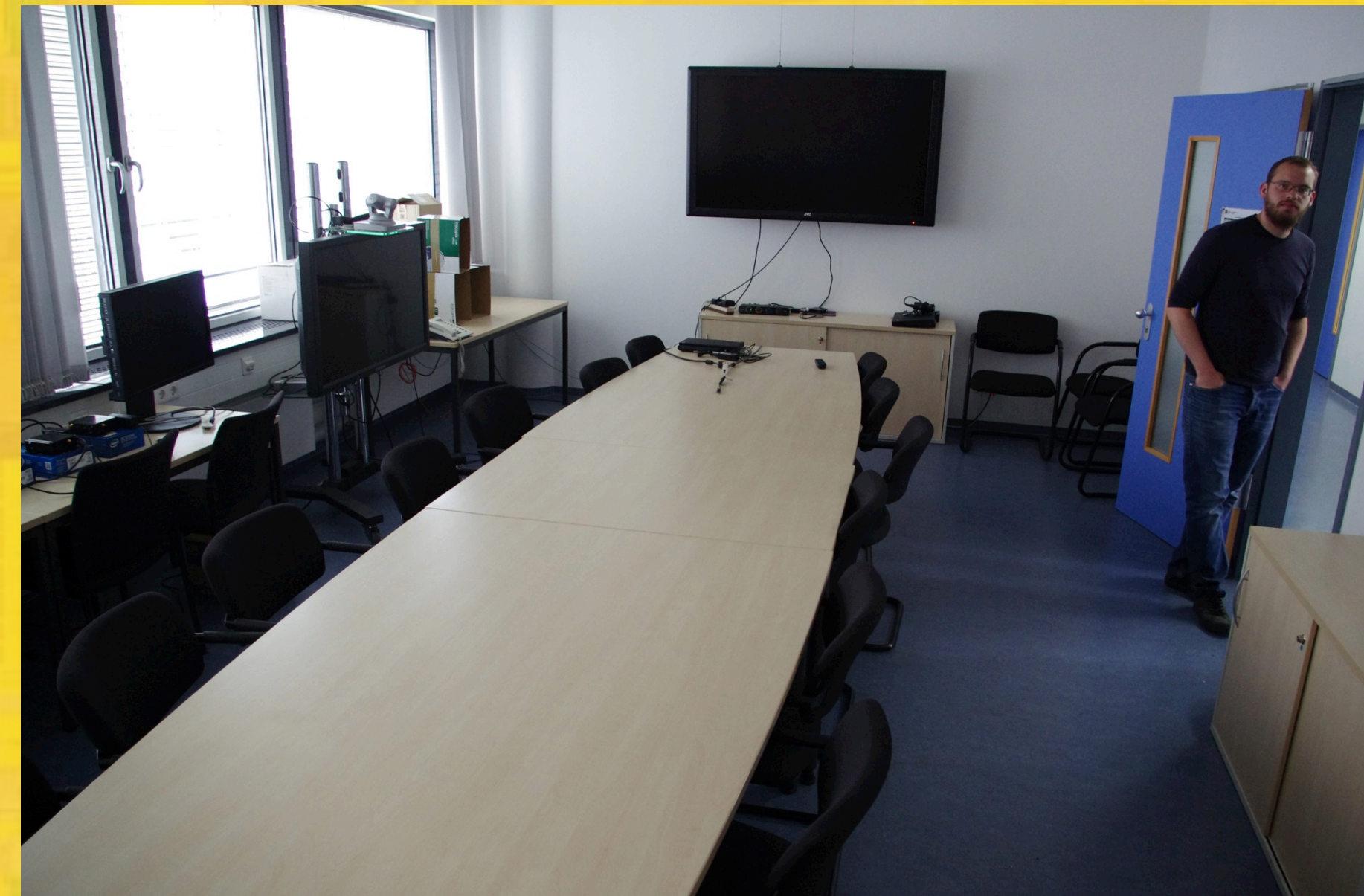
Large meeting room